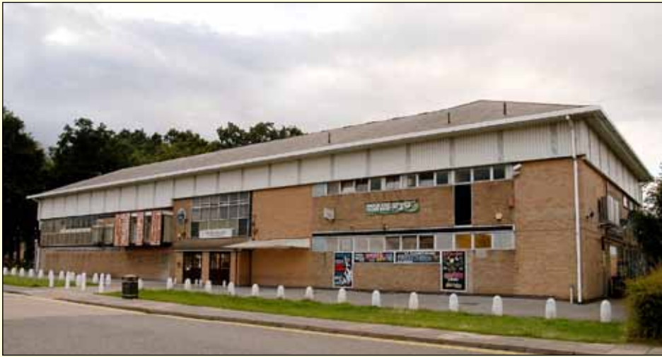
The New Parks Club is one of the biggest in the Midlands and one of the most prominent buildings on the New Parks estate.