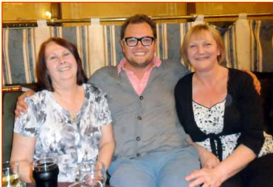
Comedian Alan Carr visited a Tyneside social club to trace his family tree for the TV show "Who Do You Think You Are?". Among those he met were FA