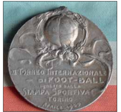
The front and back of the winners' medal from the Sir Thomas Lipton tournament in Turin in 1909. The inscription says: Torneo Internazionale Foot-ball Stampa Sportiva Torino Aprile 1909.