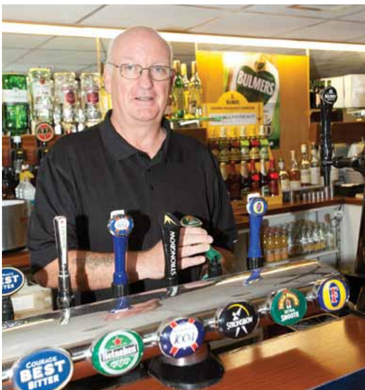
RANGE: The club stocks the full Heineken UK range of market-leading brands