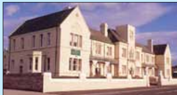
CIU SALT BURN HOUSE