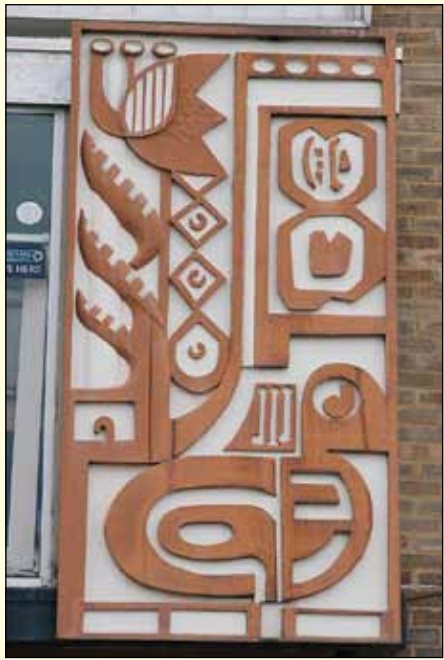
This flower motif is a pun on the club's name.

the immediate postwar boom and the club itself opened in 1953. One of Leicester's largest postwar estates it has only two pubs for competition, one of which is about to close. And, of course, the club has the advantage over its rival pubs of being able to police who comes in.