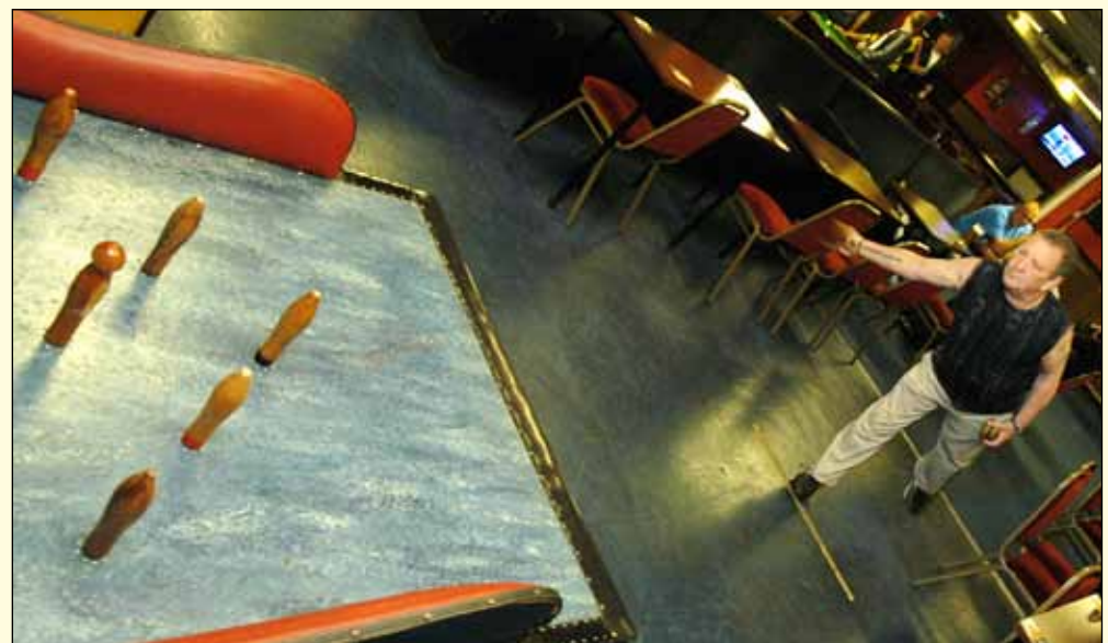
The club has three mixed and two ladies' skittle teams.

Some clubs in Leicester have suffered because of the influx of Asians in the 1960s – many of whom do not drink alcohol -- but the New Parks Estate was built in