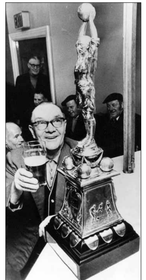
The original World Cup in place at West Auckland WMC and (below) its replacement.

Plans are also in place for a sculpture celebrating the World Cup victory and the village's mining heritage to be constructed on the village green outside the club.