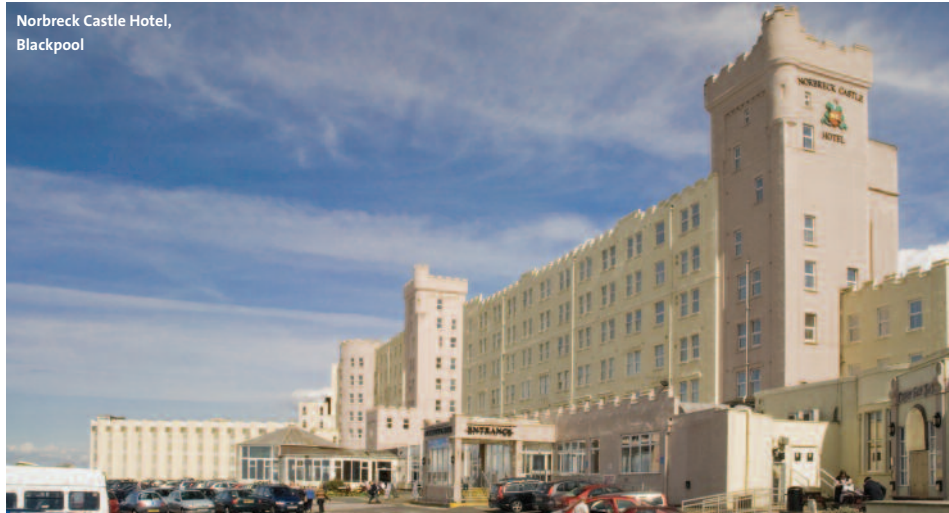
Norbreck Castle Hotel, Blackpool

With Blackpool 2017 now just two months away, Union members are being urged to attend what will be a busy weekend of club-related activities.