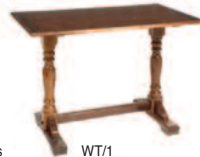
WT/1 From £81.90