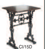
CI/15D From £64.90