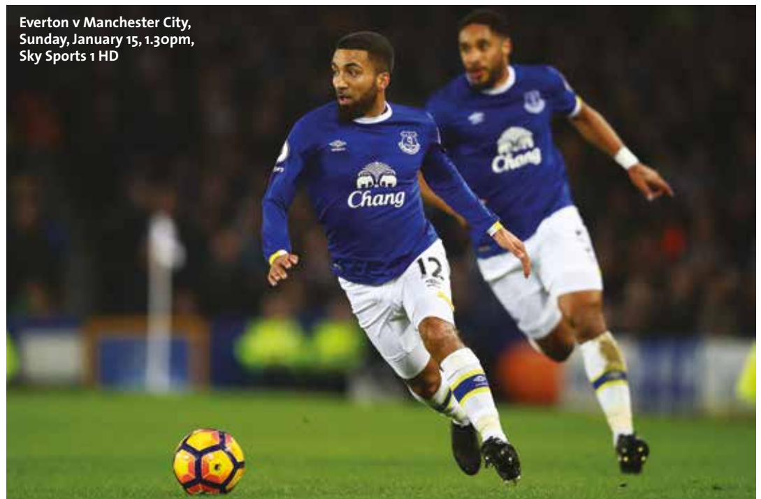
Everton v Manchester City, Sunday, January 15, 1.30pm, Sky Sports 1 HD

Friday January 13 7.45pm Sky Sports 1 HD Championship: Leeds United v Derby County